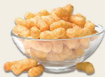
Snacks (ex. chicken masala seasoning) 0.06–0.3%