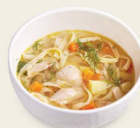
Bouillon (ex. chicken noodle soup) 0.06–0.3%